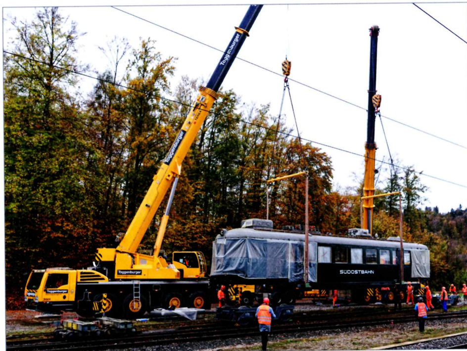
Assembling the body of ABe 4/4 No.5 and the bogies at Wald ZH, on 4 November 2022.