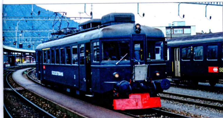
Soon the ABe 4/4 No.5 will be running under its own power again! Here are pictures from its last days in service taken at Arth-Goldau on 8 July 1990 (above), and between Wollerau and Samstagern on 18 August 1990 (right).