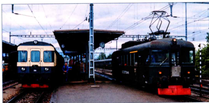
ABe 4/4 No.5 at Rapperswil on 22 May 1985.